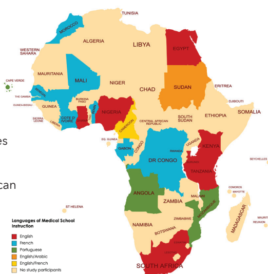
Map of countries of African study participants

The findings and recommendations presented in this policy brief emerged from the analysis of data from: a) 95 peer-reviewed articles and other literature; b) interviews with and questionnaires completed by 48 African health researchers and stakeholders from 18 African countries; and, c) questionnaires completed by 16 representatives from organisations in 6 non-African countries supporting capacity strengthening of African researchers and research institutions.