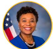
Rep. Barbara Lee United States Representative (CA-12)