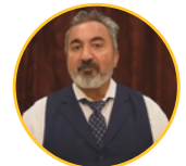
Rep. Ami Bera, MD United States Representative (CA-06)