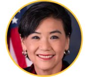
Rep. Judy Chu United States Representative (CA-28)