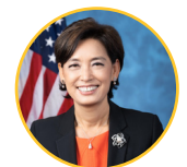
Rep. Young Kim United States Representative (CA-40)