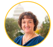
Rep. Katie Porter United States Representative (CA-47)