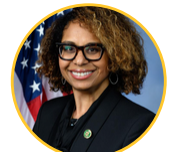
Rep. Sydney Kamlager-Dove United States Representative (CA-37)

global.health@usc.edu 1771 N St. NW, Washington, DC 20036